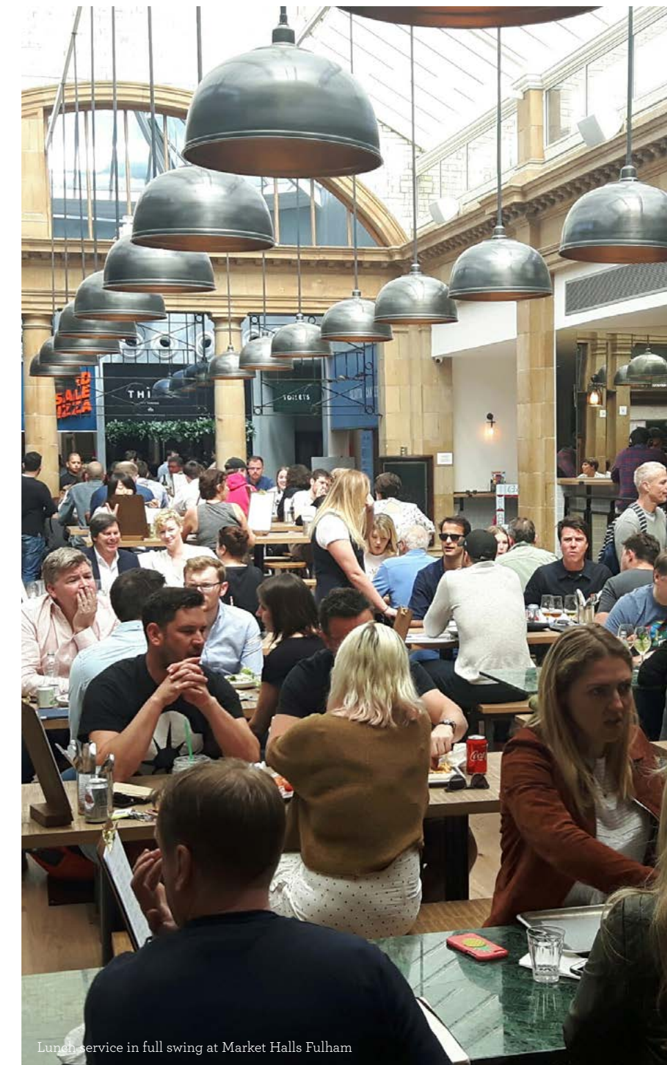
Lunch service in full swing at Market Halls Fulham

Visit our website for more information, and be sure to go and visit one of Market Halls' venues in London.