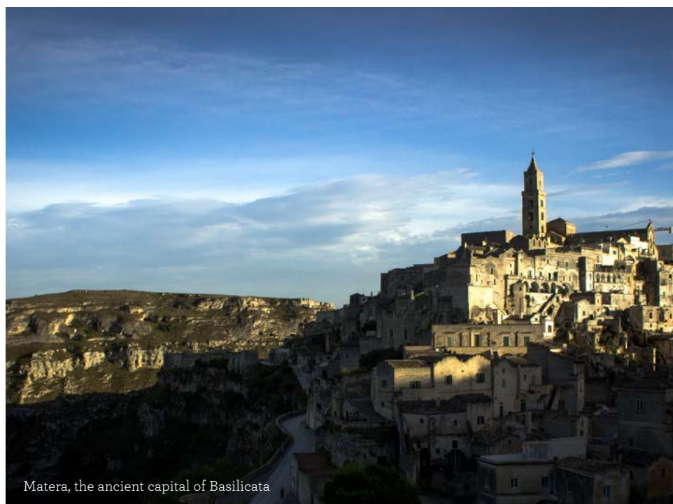
Matera, the ancient capital of Basilicata

Alois Lageder tends vines on the vertigo-inducing Dolomites of Italy’s most northerly winegrowing region