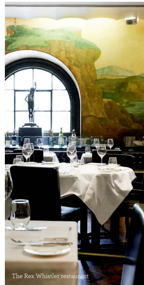
The Rex Whistler restaurant