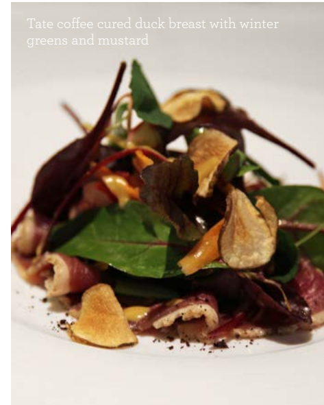
Tate coffee cured duck breast with winter greens and mustard