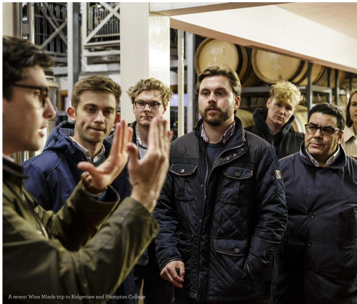
A recent Wine Minds trip to Ridgeview and Plumpton College

The programme is open to everyone working in hospitality in the UK who is still busy climbing the career ladder, and has a good basic knowledge of wine. Working in collaboration with producers and other industry experts, previous sessions have focused on 'Understanding Sweet Wine' and 'Getting to Grips with German Riesling', as well as 'The Full English' day trip to Ridgeview and Plumpton College and a session with The Benevolent about Mental Health.