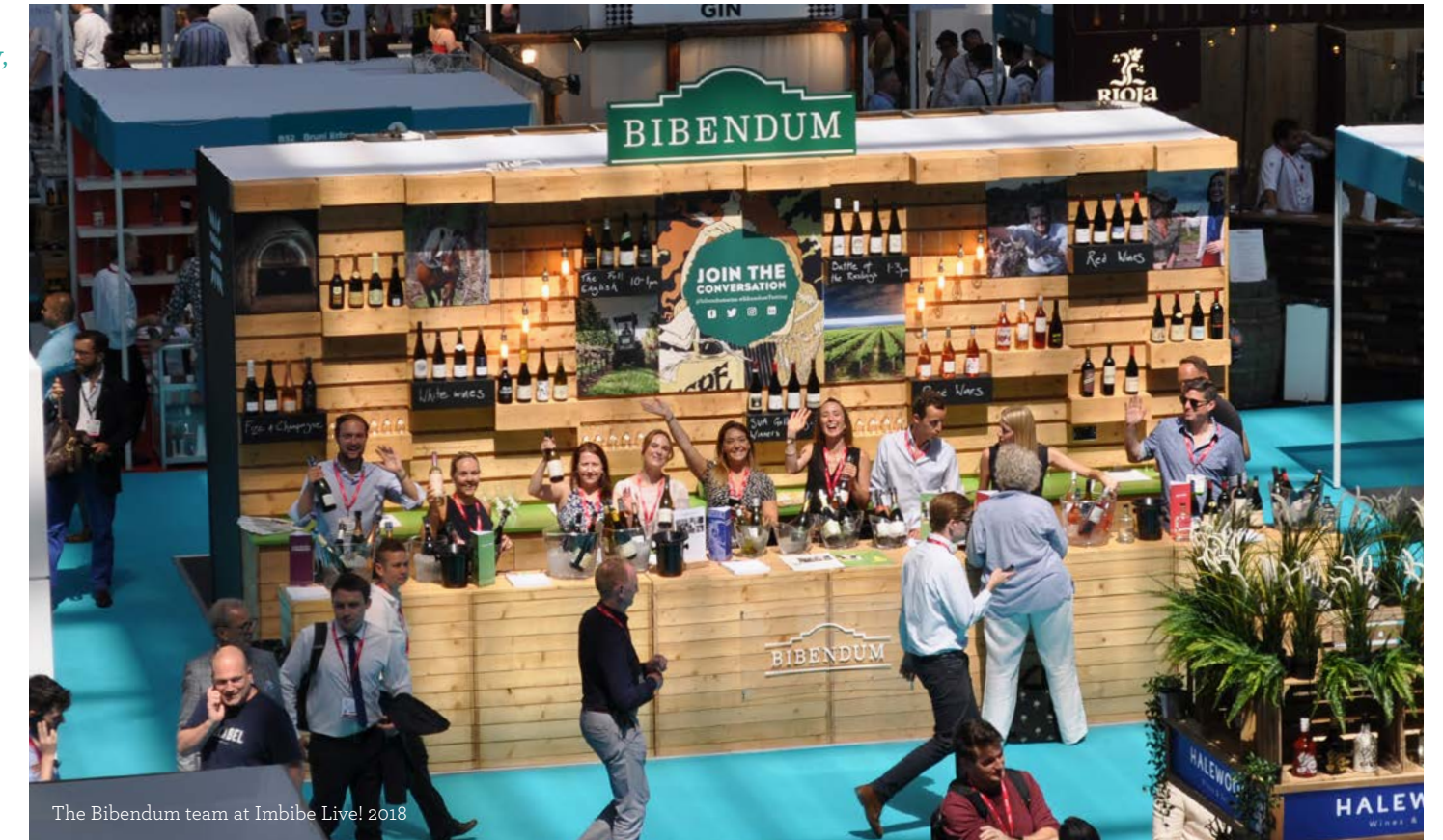
The Bibendum team at Imbibe Live! 2018

Over the last six months we hosted and took part in 16 events, ranging from workshops and new-release seasonal tastings, to our fine wine cellar tastings and supper clubs. Here are some of the highlights: