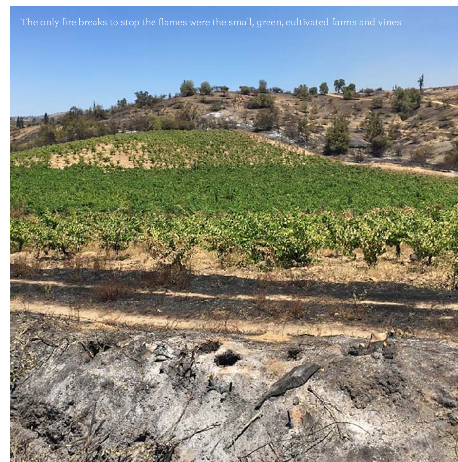
The only fire breaks to stop the flames were the small, green, cultivated farms and vines